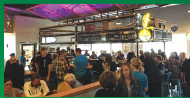
A packed house and no empty seats for a great cause.