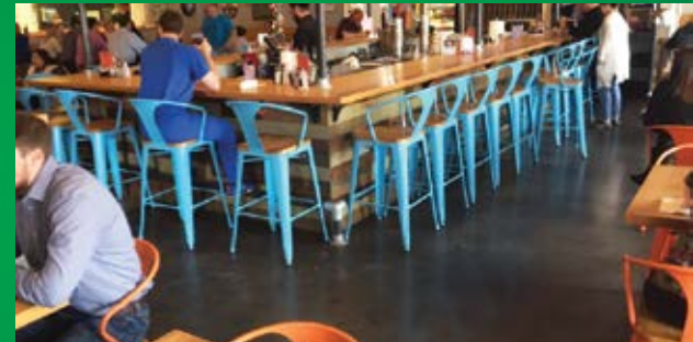
Smart pre-lunch goes await their pizza before the masses show up.