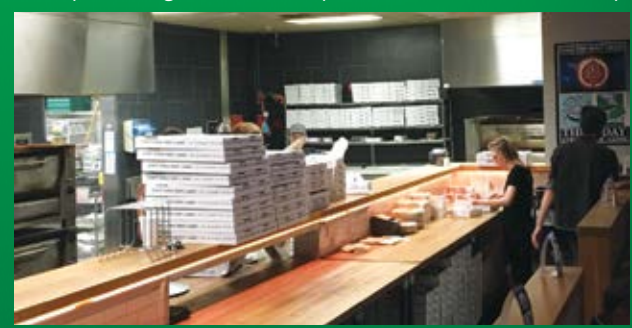
Employees prepare take out boxes and the fundraiser begins.